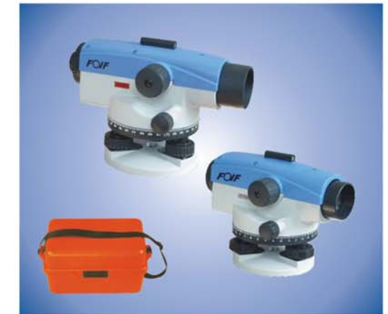
Carrying case and different color level

*Depending on staff and levelling technique